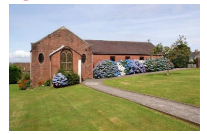
in manus tuas domine